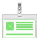
Card with straight corners